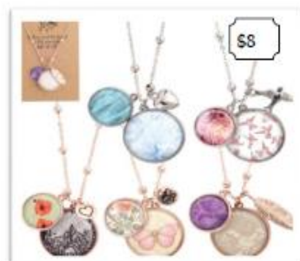
Make a statement with these beautiful, nature inspired, necklaces- 5 assorted designs- Chain length 38cm