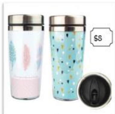
Take your coffee or tea out and about and in style with these gorgeous thermal mugs-