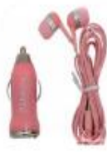
Car charger / headphones