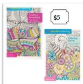
Give the gift of calm- Perfect for unwinding and relieving stress-