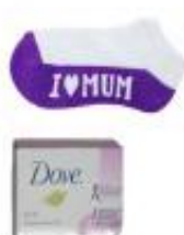
Socks & Soap