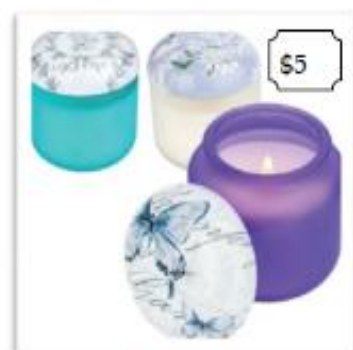
Scented candles with lids- 7cmH x 5.5cm Dia-