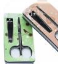
Nail Grooming Set