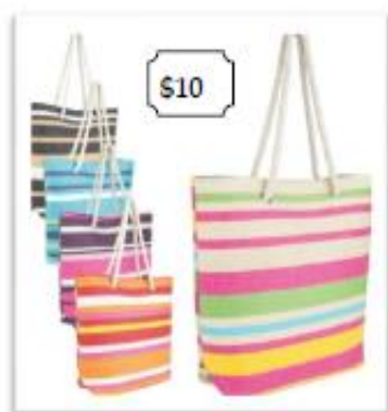
Hit the beach or park with these stylist Tote bags- Size: 43cm x 35cm