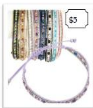
Adjusted beaded bracelets- 8 colours to choose from-