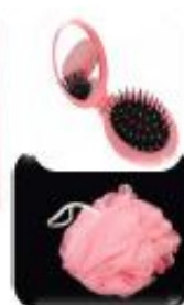
Mirror/brush and loofah