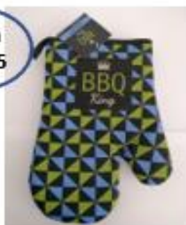
Oven Mit $5