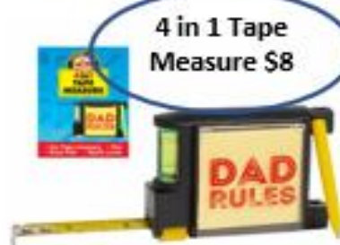
4 in 1 Tape Measure $8