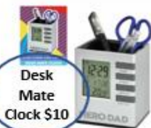
Desk Mate Clock $10