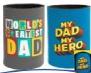
Stubby Holder $8