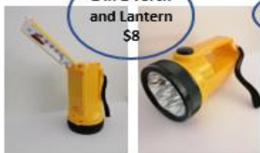
2 in 1 Torch and Lantern $8