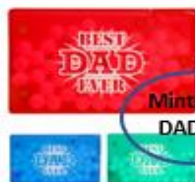
Mints For DAD $2