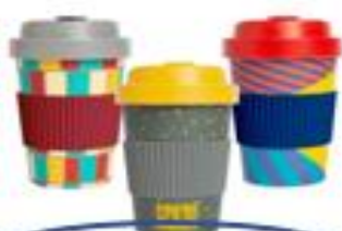
Travel Mug $8