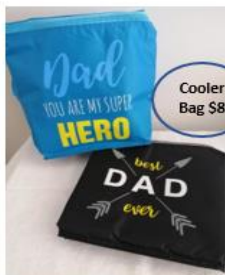
Cooler Bag $8