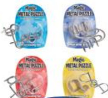
Metal Puzzle $5